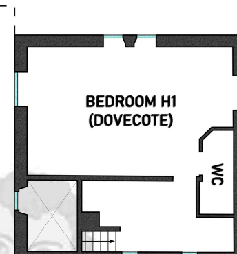
SECOND FLOOR & DOVECOTE